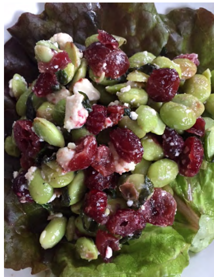
BARBARA B. OLIVER

1 16-ounce bag frozen, shelled edamame 1/2 cup dried cranberries